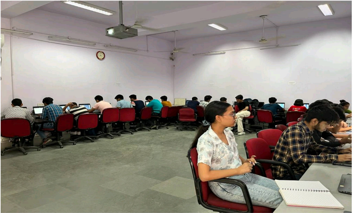
Computer Lab -4 : (New Block First Floor)