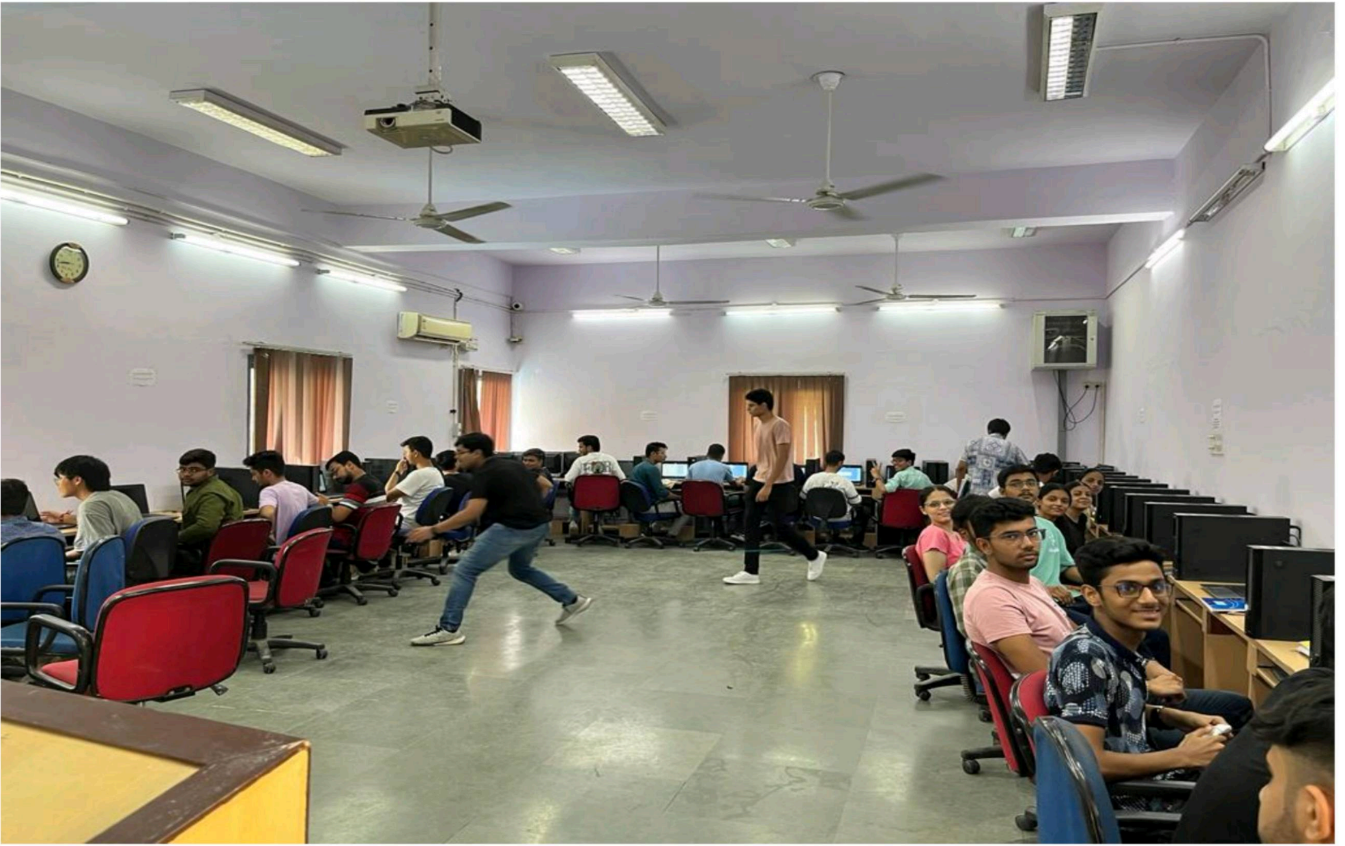
Computer Lab -3 : (New Block First Floor)