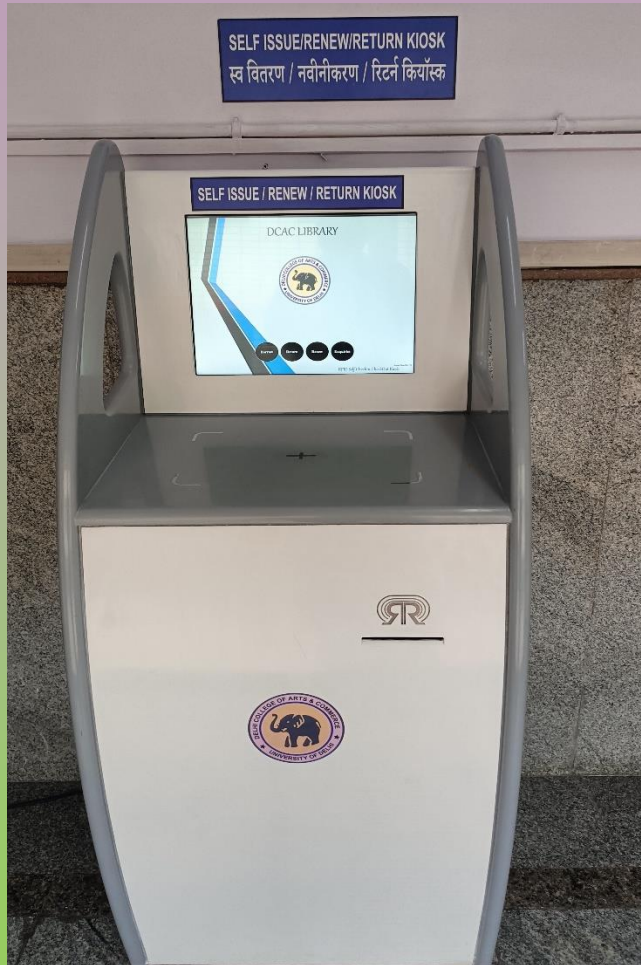
SHELF CHECK- IN/SELF CHECK-OUT KIOSK