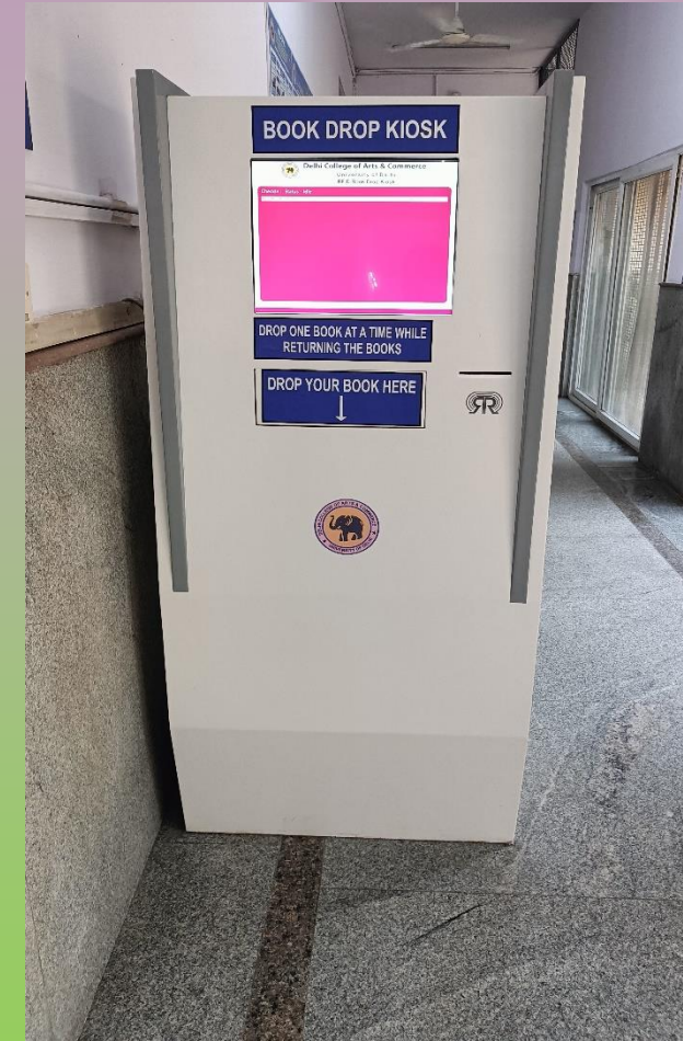
BOOK DROP MACHINE